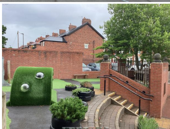
Break and Lunch playtime yard