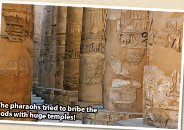
The pharaohs tried to bribe the gods with huge temples!

Representing writing, wisdom and magic, Thoth had the head of an ibis (a heron-like bird) and was often shown with a writing tablet.