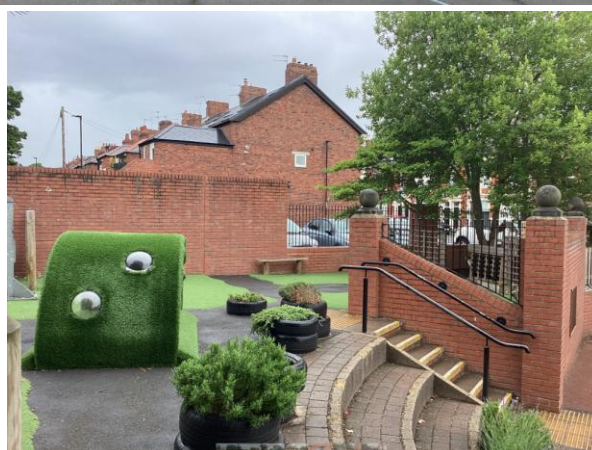
Break and Lunch playtime yard