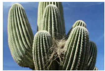
A cactus covered in spikes

The ribs of this cactus can swell as the plant's roots suck up water after a rain shower.