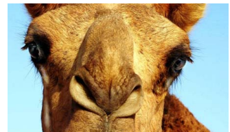
Camels have long lashes and can close their nose