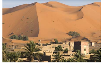
An oasis in the Sahara Desert

Sand dunes in the Sahara's sand seas (ergs) can grow to 180 metres in height. That's taller than a stack of 40 double decker buses!