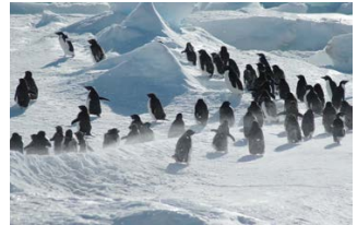
Penguins in Antarctica