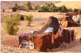
A tent pitched in the desert