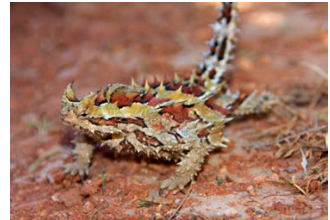
The thorny devil is a desert lizard

They may be mountain areas or really flat – and can be rocky or sandy. Deserts are all different!