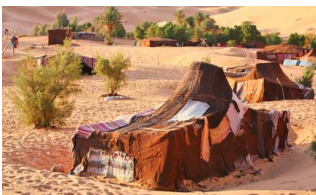
A tent pitched in the desert