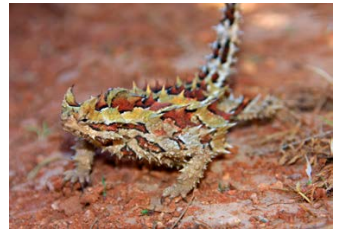
The thorny devil is a desert lizard

Deserts are places on Earth where hardly any rain falls. The weather is dry all year round, but they can be hot or cold. Deserts are also windy places. They may be rocky or sandy, covered in dunes or mountainous. Deserts are all different!