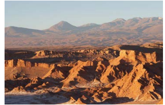
The Atacama Desert is in Chile

In the Atacama, plants and animals use water in the fog that forms over the hills to stay alive.