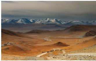
Desert in Mongolia

The Sahara Desert stretches all the way across North Africa.